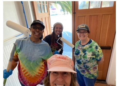
Energizing the Entry